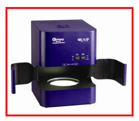
Fig. 1 – ColonyDoc-It Imaging Station

The ColonyDoc-It Imaging Station (Fig. 1) can be used for effective inhibition zone sizing.